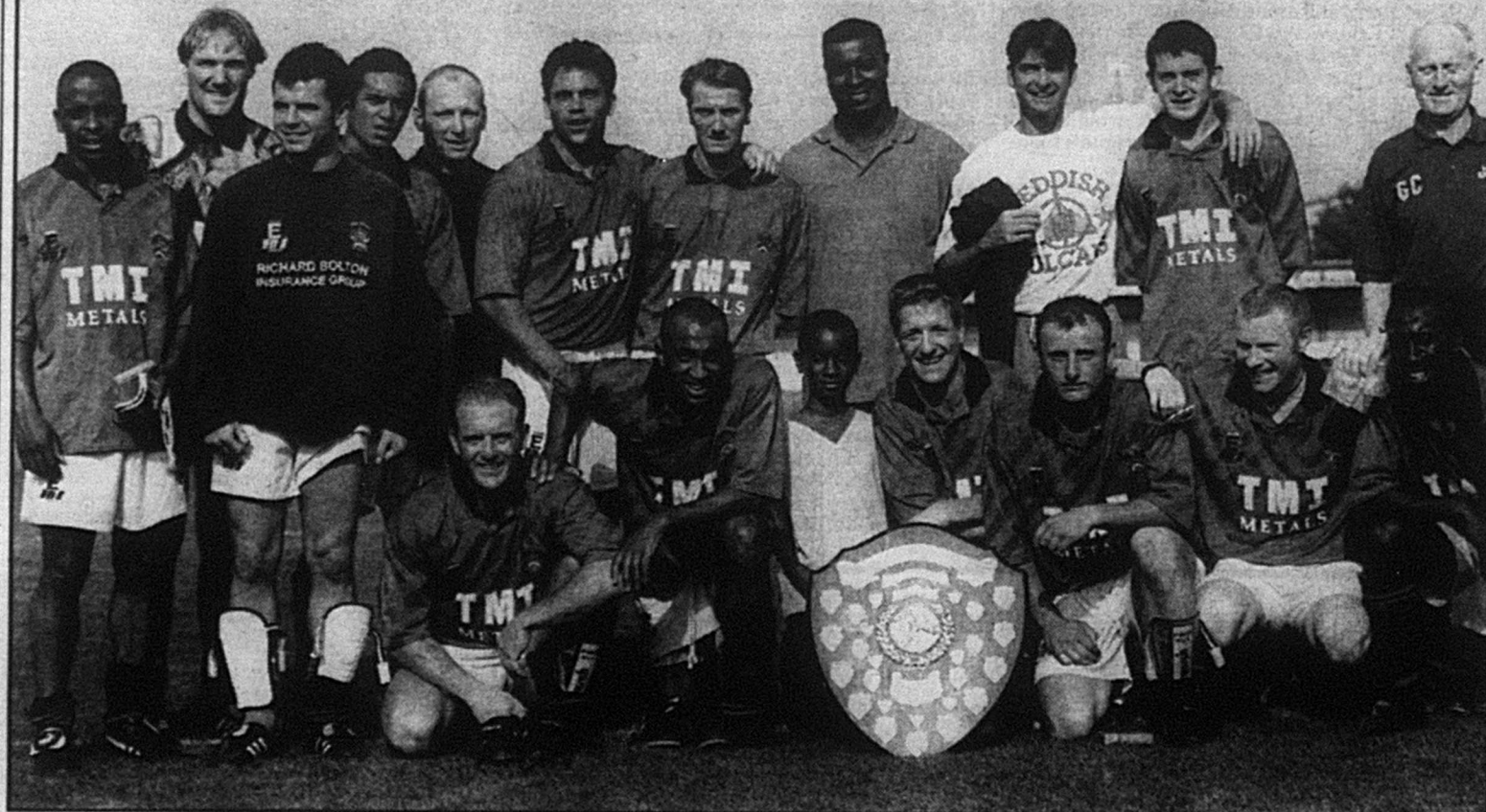
ONE DOWN ... the Hyde United players celebrate with the UniBond League Challenge Shield.